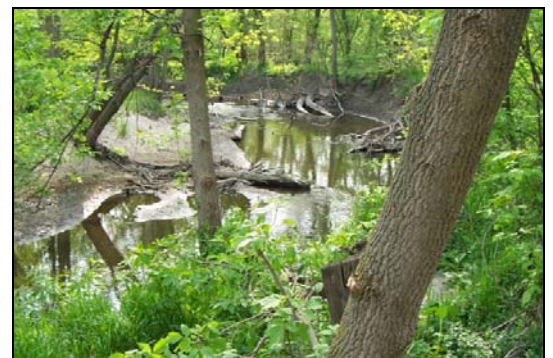
Beautiful woods & trails along tranquil Deep River